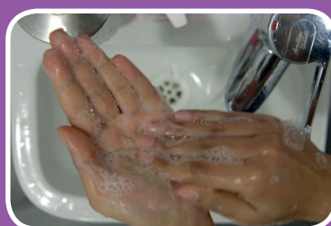
8. Rub the tips of your fingers on the palm of your other hand. Do the same with other hand.