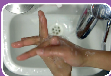
5. Rub your hands together and clean in between your fingers.