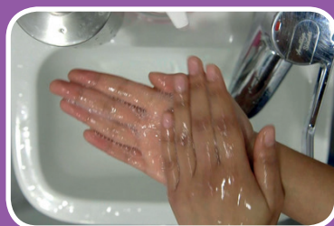
3. Rub your hands together.