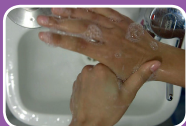
7. Rub your thumb using your other hand. Do the same with the other thumb.