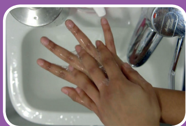
4. Use 1 hand to rub the back of the other hand and clean in between the fingers. Do the same with the other hand.