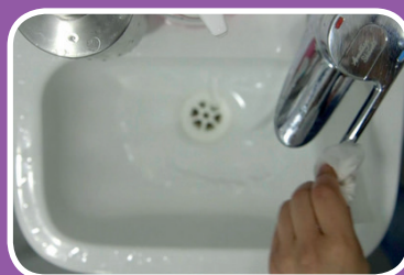
11. Use the disposable towel to turn off the tap.